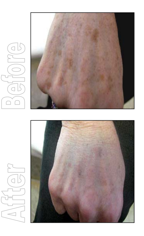
Figure 2: Female, skin type III (before & after 2 LHE treatments)

It is interesting to note that in addition to the photorejuvenation treatments reported above, we have been using the Radiancy LHE system in our clinic to treat patients with erythematous keloids. In these patients the effect of collagen remodeling appears to be more dramatic, with most patients experiencing reduction in hypertrophy, softening of the scar and elimination of pain. This is in addition to a marked reduction in erythema.